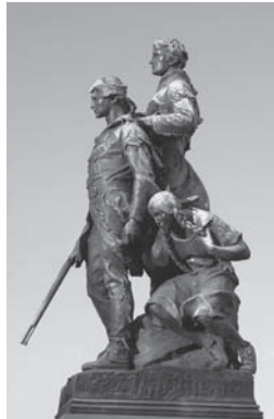
This historic statue, located in Charlottesville, Virginia, commemorates the 1803–1806 journey of Lewis, Clark, and Sacagawea.

From the dramatic bluffs of Cape Disappointment on the Washington coast, the vista was quite the opposite of disappointing. As far as my eyes could see, out to the farthest western horizon, the rolling swells of the Pacific Ocean marched toward me, whitecaps flashing in the sun, only to crash into sparkling foam on the rocks far below my perch. If I were looking for a spot that states “Continent Ends Here” with utmost finality, this would be it. And I couldn’t help repeating out loud William Clark’s most famous journal entry from his epic expedition with Meriwether Lewis: “Ocian in view! O! the joy.”