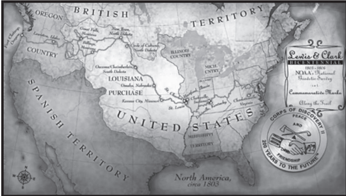
“American Odyssey” by Dayton R. Duncan, reprinted by permission of the author. All rights reserved. Photograph: “EXPLORERS WITH NATIVE AMERICAN GUIDE” Copyright © North Wind Picture Archives/Alamy. Map: Reprinted courtesy of the NOAA. All rights reserved.

passes overhead, I look up and think that the passengers inside don’t know what they’re missing. And whenever I reach the Pacific coast, I still can’t help exclaiming, “Ocian in view! O! the joy.”